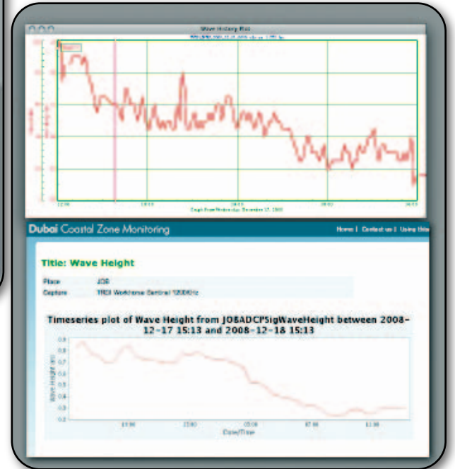
Wave plots of DMRS CODAR data (top) and JOB ADCP wave data on 17 Dec. 2008 (obtained from Dubai Municipality website).

All Data Shown Are Provided Courtesy of Dubai Municipality & DOME International LLC.