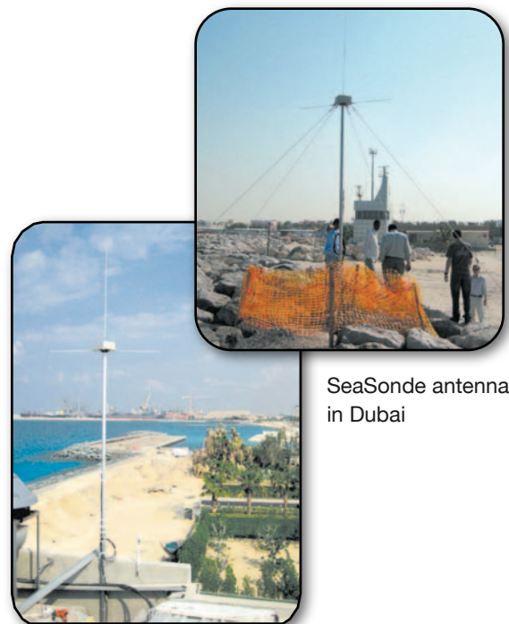
SeaSonde antennas in Dubai

Dome International LLC, with 10 offices in the Middle East Region, is a leading health, safety and environment consultancy firm inside the UAE.